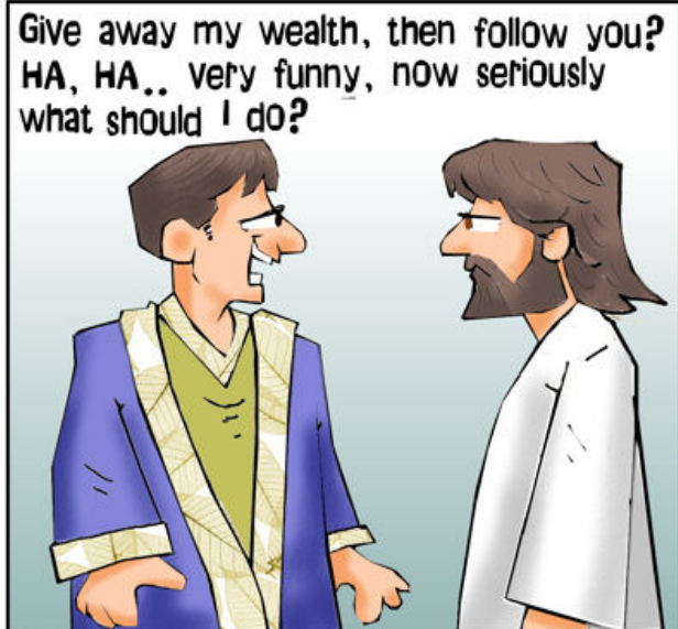
The 'Rich Young Ruler' debates money management philosophies with Jesus Christ. Matthew 19